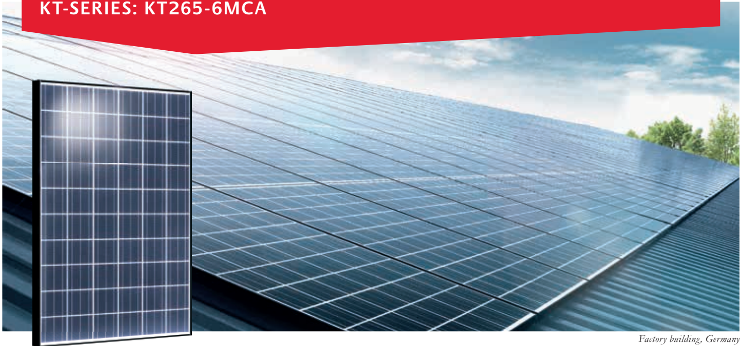
Factory building, Germany